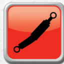
Bent or dented