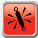
Broken internally or jammed in collapsed position