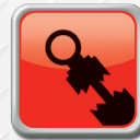
Dust tube broken