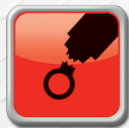
Upper or lower mount broken