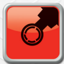
Upper or lower bushing broken